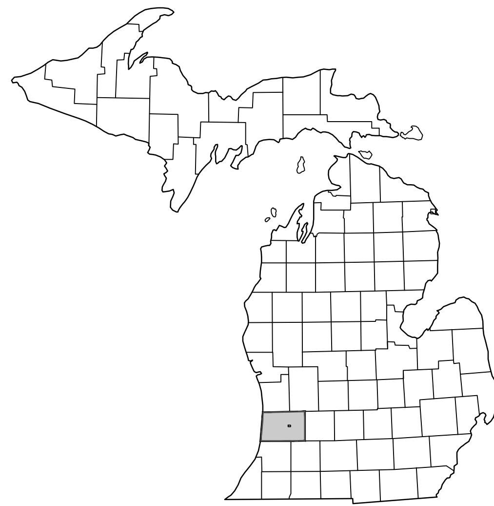
ALLEGAN COUNTY, MI